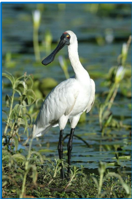
Royal Spoonbill