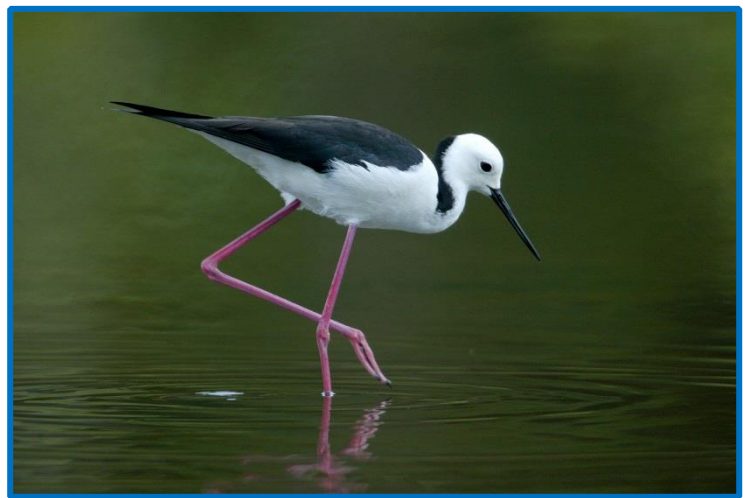
Black-winged Stilt