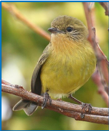
Yellow Thornbill

This edition's photos are courtesy of the Queensland Murray-Darling Committee's photo library, but I look forward to receiving photos from TBO members that can be shared in the next edition.