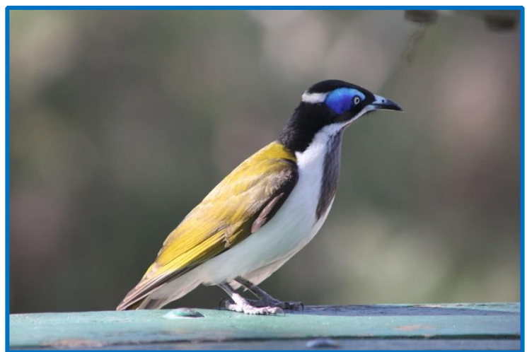
Blue-faced Honeyeater