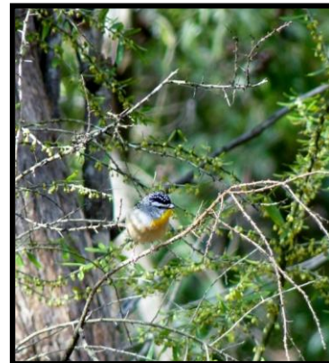
Male Spotted Pardalote