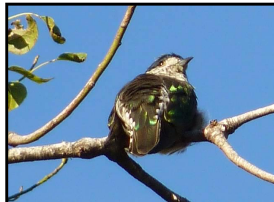
Shining Bronze Cuckoo