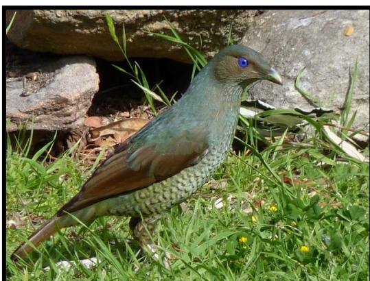
Female Satin Bowerbird