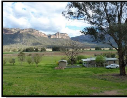
Oskas Cottage – Glen Davis