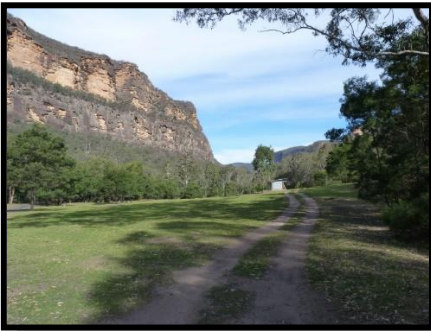
Coorongooba camping area

When Rob read about Capertee Valley in the Birdlife Magazine, we decided to incorporate a visit there on our annual trip to Canberra. Capertee Valley is located on the western edge of the Blue Mountains and is the widest enclosed valley in the world – wider and longer than the Grand Canyon. The scenery is spectacular!