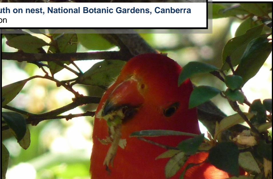
King Parrot feeding in tree, National Botanic Gardens, Canberra