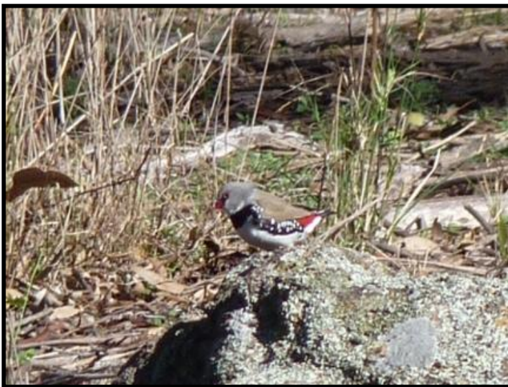
Diamond Firetail Finch

Further information on the area was obtained from www.bmbirding.com.au (an excellent website) and Mudgee National Parks office. We booked 3 nights' accommodation at Oskas Cottage (fully self-contained), near Glen Davis. There is a fire trail behind the cottage which we walked each morning. We had been told the Regent Honeyeater nests in this area and although we think we had a glimpse of this rare and endangered bird high in the tree tops, we were not confident enough to report our sighting. We did see the Yellow-tufted Honeyeater, a first for us. Such a brilliant yellow! It was wonderful to sit and watch Diamond Firetail Finches busily building nests.