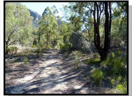
Firetrail behind Oskas Cottage

Further information on the area was obtained from www.bmbirding.com.au (an excellent website) and Mudgee National Parks office. We booked 3 nights' accommodation at Oskas Cottage (fully self-contained), near Glen Davis. There is a fire trail behind the cottage which we walked each morning. We had been told the Regent Honeyeater nests in this area and although we think we had a glimpse of this rare and endangered bird high in the tree tops, we were not confident enough to report our sighting. We did see the Yellow-tufted Honeyeater, a first for us. Such a brilliant yellow! It was wonderful to sit and watch Diamond Firetail Finches busily building nests.