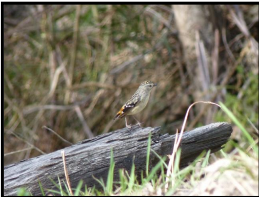
Female Spotted Pardalote