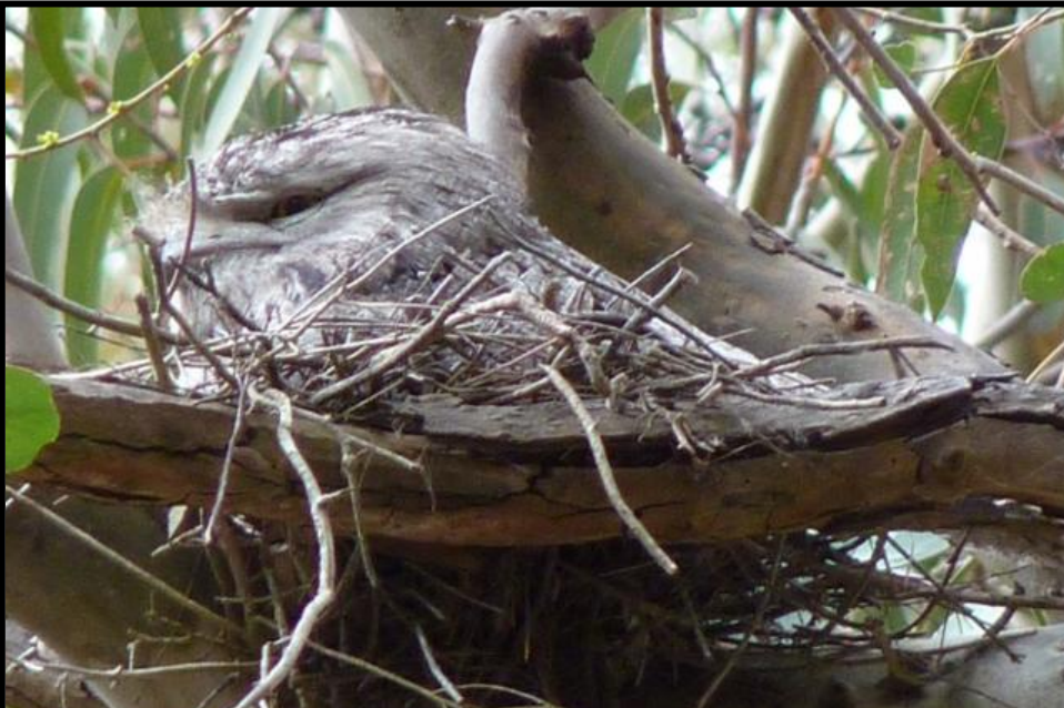
Tawny Frogmouth on nest, National Botanic Gardens, Canberra