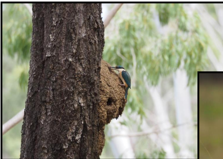
Rainbow Bee-eaters (below) Sacred Kingfisher at nest (left) Col Hughes