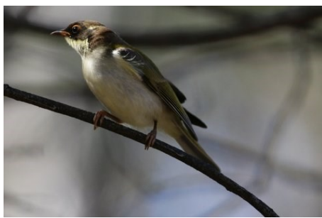
White-naped honeyeater (immature)