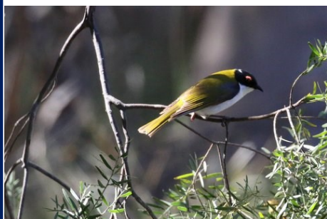
White-naped honeyeater (adult)