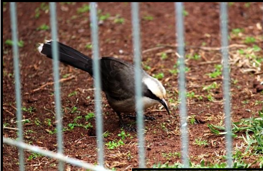
Bowerbirds Grey-crowned Babbler