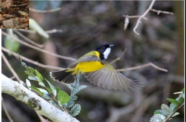
Male Golden Whistler