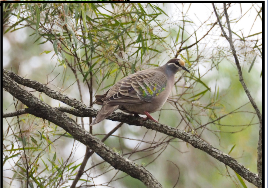
Common Bronze-wing