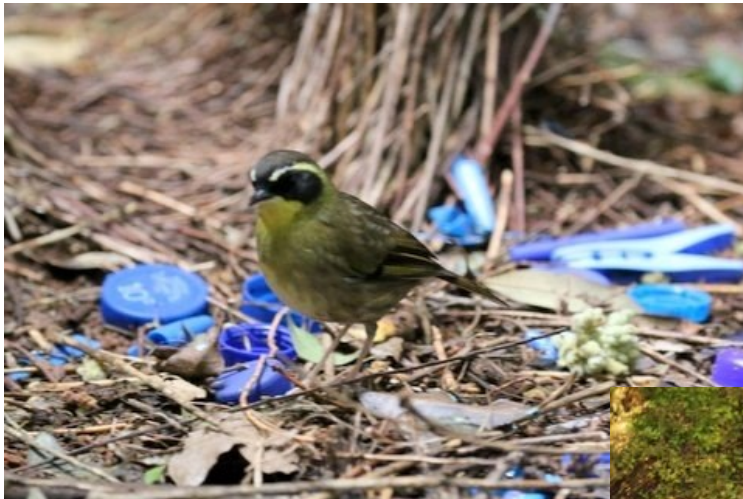
Male Yellow-throated Scrubwren...at whose bower?