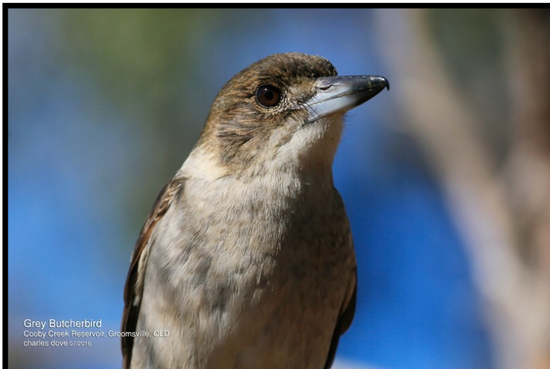
Grey Butcherbird Cooby Creek Reservoir, Groomsville, QLD charles dove 07/2016