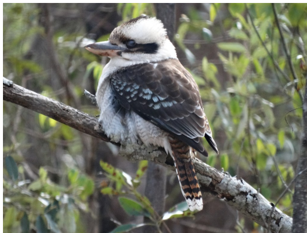
Kookaburra, Duggan Park

All positions will be declared vacant, so please consider putting up your hand to take on a role to ensure the continuity of your club.