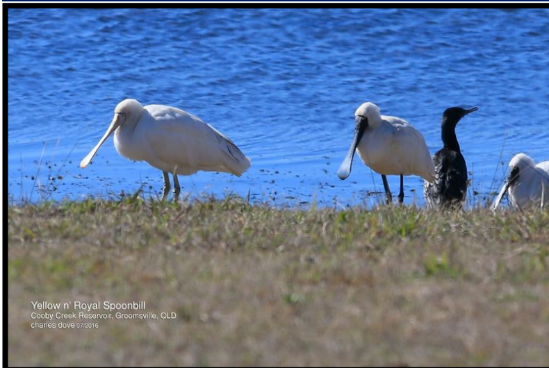
Yellow n' Royal Spoonbill Cooby Creek Reservoir, Groomsville, QLD charles dove 07/2016