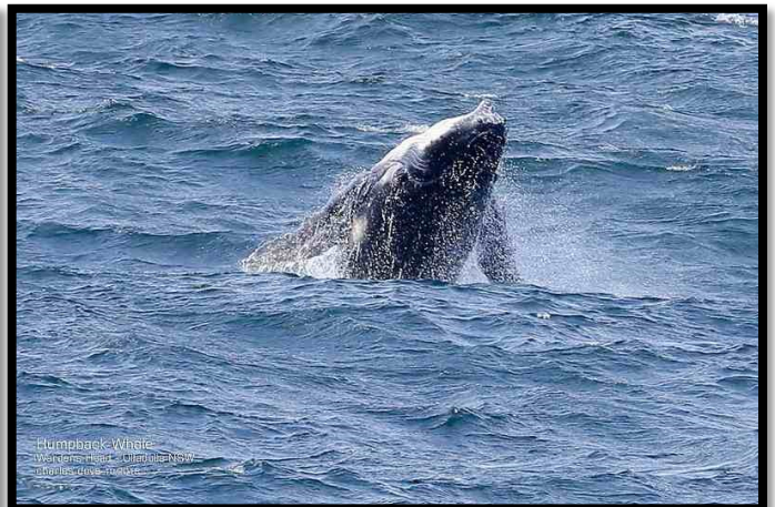
Humpback Whale