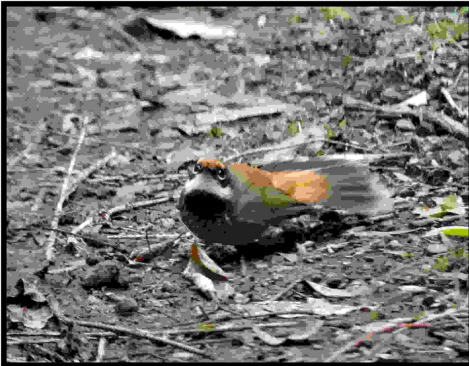
Rufous fantail, LfW property, Wengenville