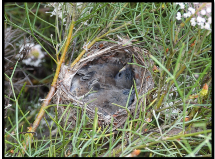
Brown Honeyeater and chicks, LfW property Merritts Creek.