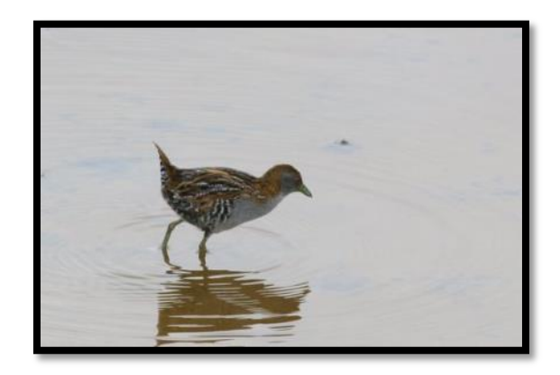
Baillon's Crake