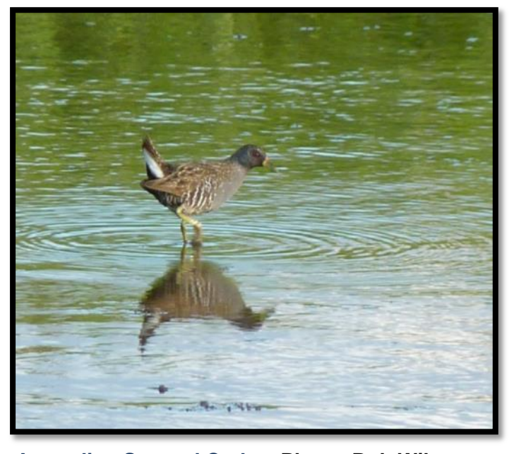
Australian Spotted Crake