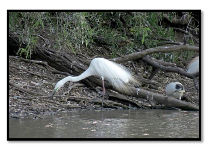
And all in the last week or so (23<sup>rd</sup> Nov) around the valley: Great Egret, Intermediate Egret and Royal Spoonbill , all in breeding plumage.