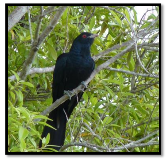
Common Koel