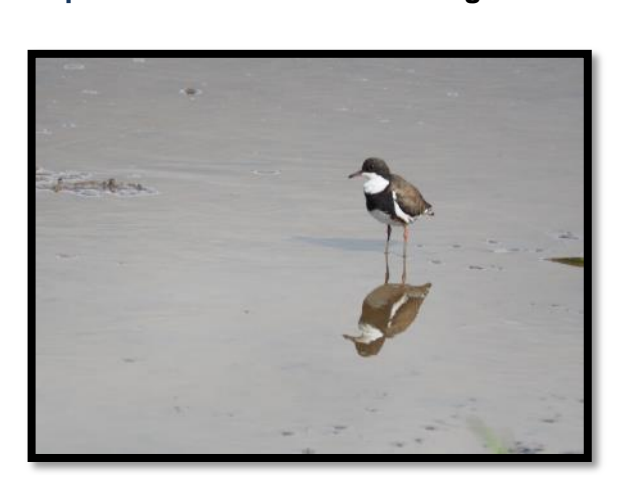
Red-kneed Dotterel