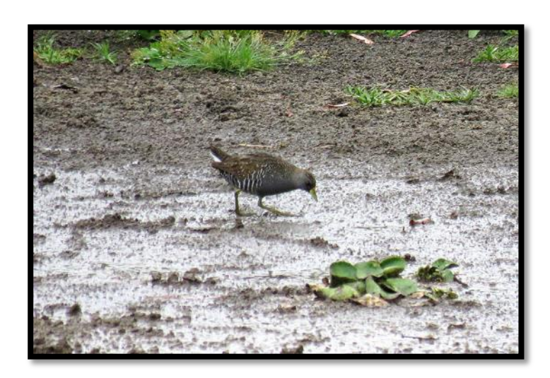
Spotted Crake out in the open in the rain