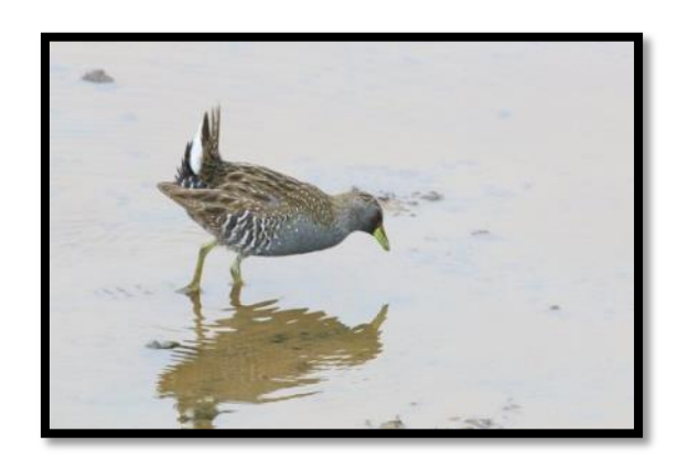
Spotted Crake

At Lake Apex we saw Magpie Geese, Plumed Whistling Duck, Maned Duck, Black Duck, Grey Teal. Hard Head, Grebe, White Ibis, Cattle Egret, Great Egret, Intermediate, Little Egret, Little Pied Cormorant, Darter, Swamphen, Moorhen, Coot, Plover, Caspian Tern, Crested Pigeon, Peaceful Dove, Pheasant Coucal, Koel, Sacred Kingfisher, Little Corella, Rainbows Lorikeet, Scaly-breasted Lorikeet, Brown Honeyeater, Striped Honeyeater, Noisy Miner, Grey Butcherbird, Magpie, Figbird, Olive-backed Oriole, Willy Wagtail, Peewee, Crow, Reed Warbler. Total 30 species .