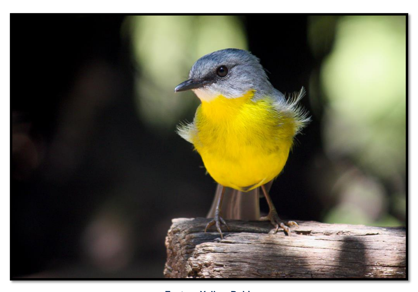
Eastern Yellow Robin