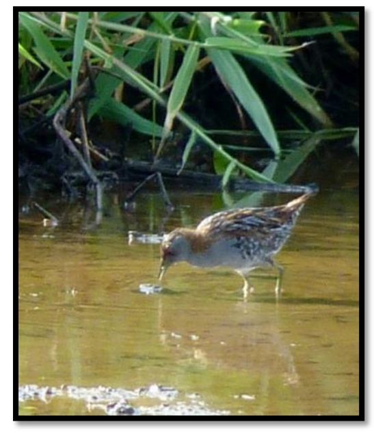
Baillon's Crake

Very popular subject this month, has been the Baillon's and Spotted Crake in the Lockyer Valley