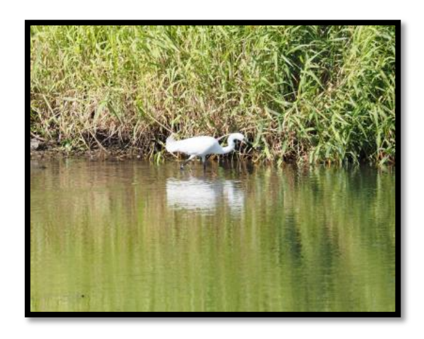
Little Egret