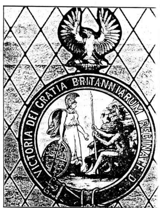
South Australia's original official seal, with the piping shri above it. The seal is featured in a Government House windo