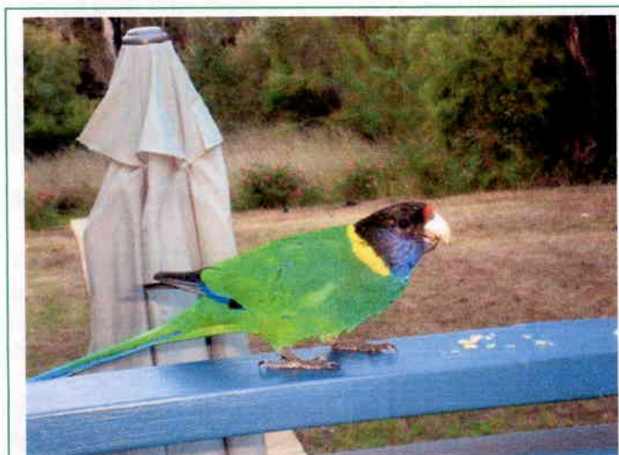
Australian Ringneck.

We also visited Pemberton and saw the giant Karri and Jarrah eucalypts. In the carpark at the giant Karri tree, we were swamped with Western Rosellas (another first for me) and Australian Ringnecks as the birds hoped to be fed by the tourists. There were also lots of noisy White-tailed Black-Cockatoos and Red-tailed Black-Cockatoos on our travels. The south-west of WA has many limestone cave systems and we ventured into several of them to admire the amazing formations.