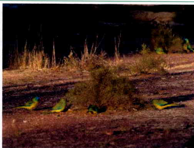
Turquoise Parrots.