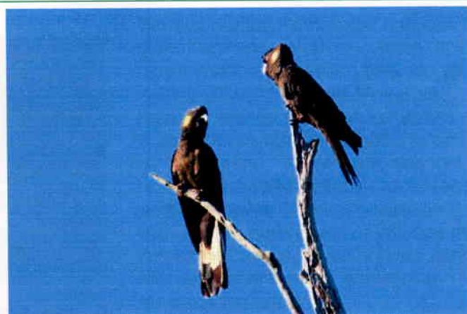
Yellow-tailed Black-Cockatoos.