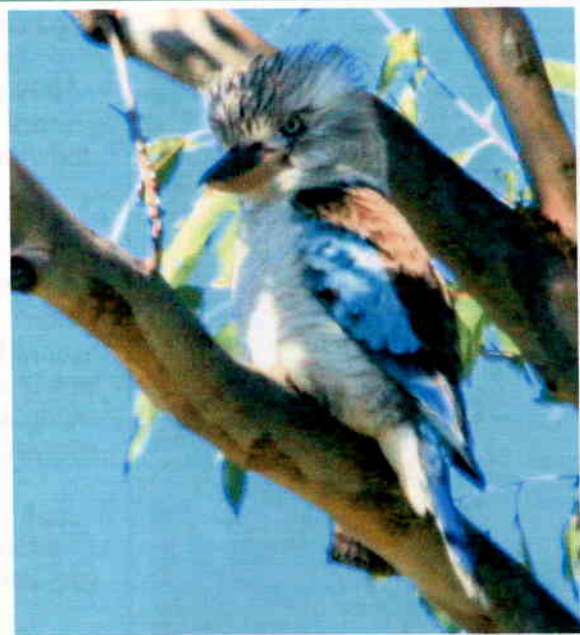
Blue-winged Kookaburra.