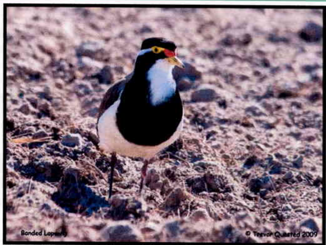
Banded Lapwing.

About a year ago I told you I thought I saw what appeared to be Blue-winged Parrots here. It was a bit hard to tell as I only saw them in flight. You said they were more likely to be Turquoise Parrots. They are back and they are Turquoise Parrots. Not much evidence of the red wing patch on the males so I presume they are juveniles. Some showed the reddish central patch on the under parts.