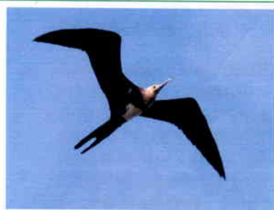
Christmas Island Frigatebird.