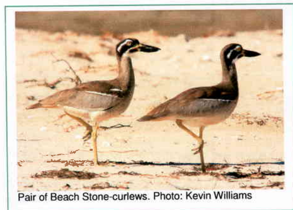
Pair of Beach Stone-curlews.