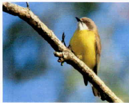
White-throated Gerygone.

Species list: Brown Cuckoo-Dove, Peaceful Dove, Bar-shouldered Dove, Wonga Pigeon, Little Lorikeet, Pale-headed Rosella, Laughing Kookaburra, White-throated Treecreeper, Variegated Fairy-wren, Spotted Pardalote, Striated Pardalote, Weebill, Western Gerygone, White-throated Gerygone, Noisy Friarbird, Lewin's Honeyeater, Yellow-faced Honeyeater, White-naped Honeyeater, Scarlet Honeyeater, Eastern Yellow Robin, Eastern Whipbird, Crested Shrike-tit, Golden Whistler, Rufous Whistler, Grey Shrike-thrush, Black-faced Monarch, Leaden Flycatcher, Grey Fantail, Spangled Drongo, Black-faced Cuckoo-shrike, Varied Triller, Olive-backed Oriole, Torresian Crow, Red-browed Finch, Mistletoebird and Silvereeye.