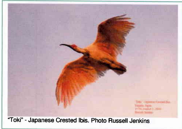
"Toki" - Japanese Crested Ibis.