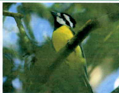
Crested Shrike-tit.