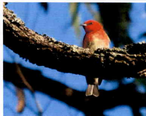
Scarlet Honeyeater.