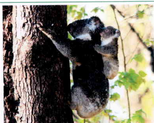
Mother koala with young.