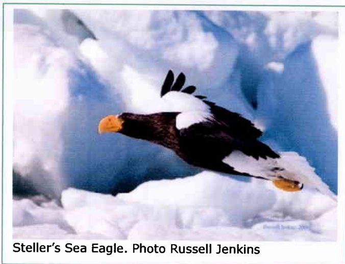
Steller's Sea Eagle.