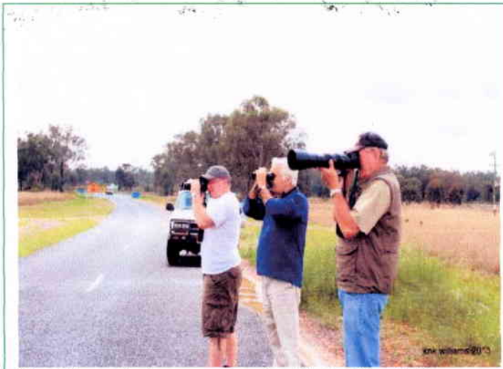
The Three Amigos spy again.