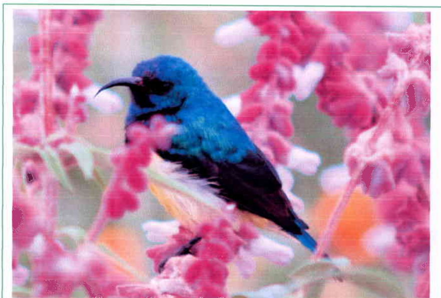
Variable Sunbird, Sept 2009, Karatu, Tanzania.