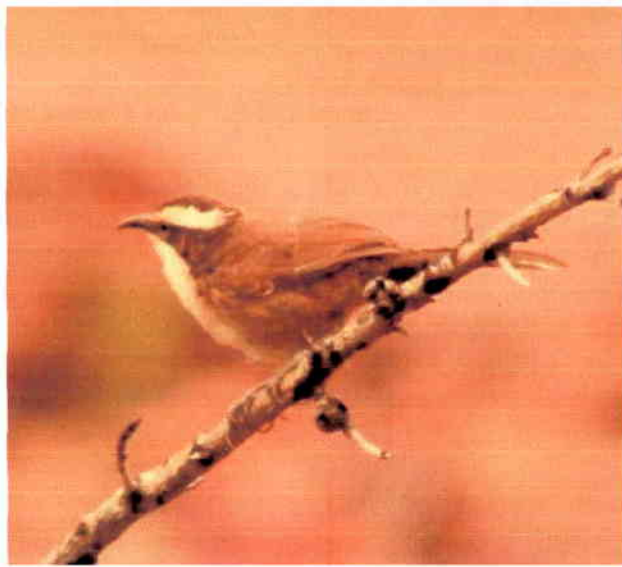
White-browed Babbler.

should have been the Lake Coolmunda access road but due to the flooded creek we had to go back through Inglewood.