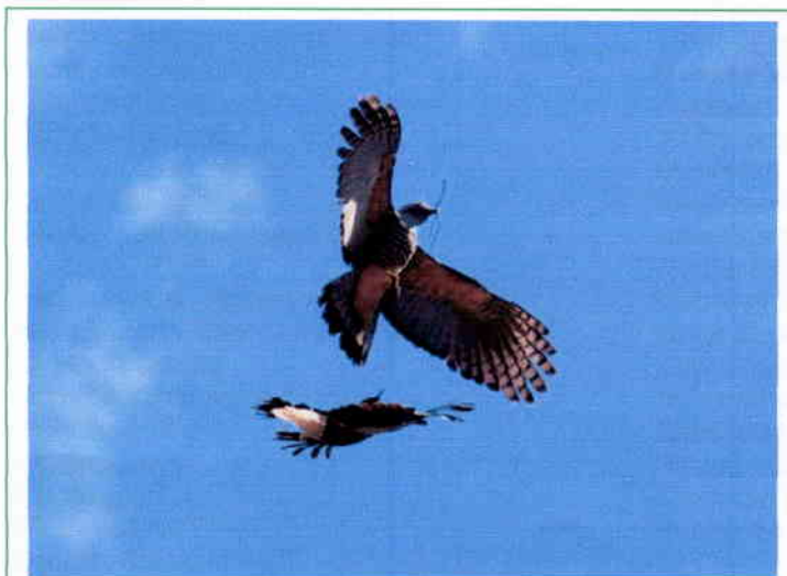
Pacific Baza under attack.