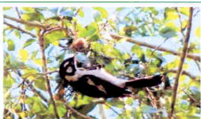
White-eared Monarch, Redwood Park.

White-eared Monarch, Silver Gull, Eastern Rosella and Blue Bonnet are recent additions for the 2010 Challenge. Hoping for more during the October Species Census!