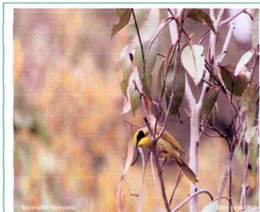
Yellow-tufted Honeyeater.

All we could do at this stage was retrace our steps and book in to the caravan park, have lunch and wait for a break in the weather again. We were not to be disheartened. After lunch we did the "loop" around Lake Coolmunda. Taking right hand turns, the loop takes you onto the highway, then the Stanthorpe, Texas and Inglewood Roads. The next right