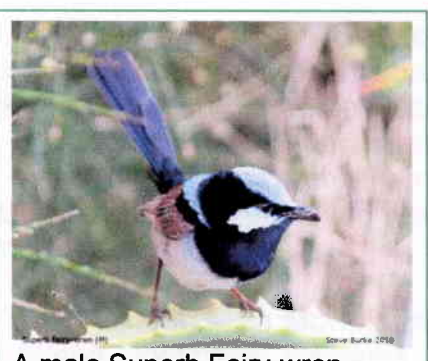
A male Superb Fairy-wren.

The Committee would like to take this opportunity to wish all our readers a happy and safe holiday season and many hours of great All we want for birdina. Christmas is another 10 species for the Challenge.