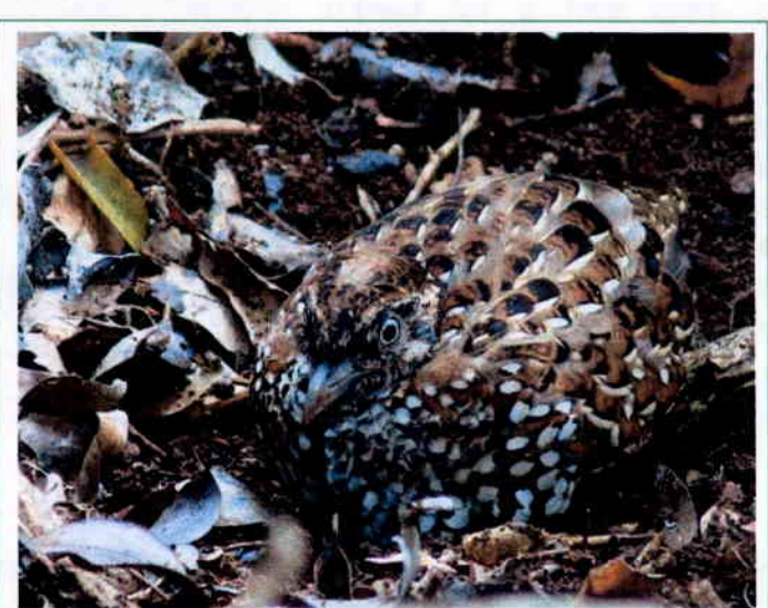
A Black-breasted Button-quail.

Recently we travelled north to Rainbow Beach and Tin Can Bay to escape Toowoomba's wintery gales. Inskip Point, which is just north of Rainbow Beach, is a well known spot to see Black-breasted Button quail (BBBQ) and it is also a place to catch a barge to Fraser Island. However, in order to reach the barge you must traverse about 300m of soft sand. One morning while looking for BBBQ's we were