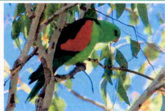
Red-winged Parrot.

We returned to the lake shore to eat our morning tea and were deafened by the cacophony of calls from Little Corella perched in the River Red Gums ( E.camaldulensis ) lining the lake shore. While a lone Gull-billed Tern patrolled over