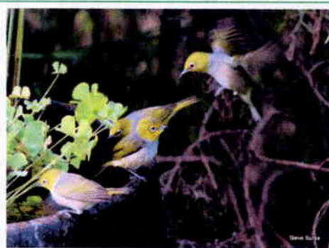
Silvereyes enjoying a bath.

The Committee would like to encourage members who plan to attend monthly outings to inform the outing leader of their intention to come along. This helps with planning and will assist the leader in determining whether to get the outing underway or whether to wait around for a little longer. It would also help if you give the outing leader a contact number so you can be contacted if running late.