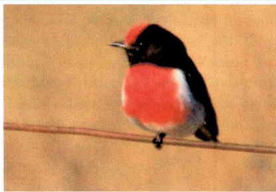
Red-capped Robin.