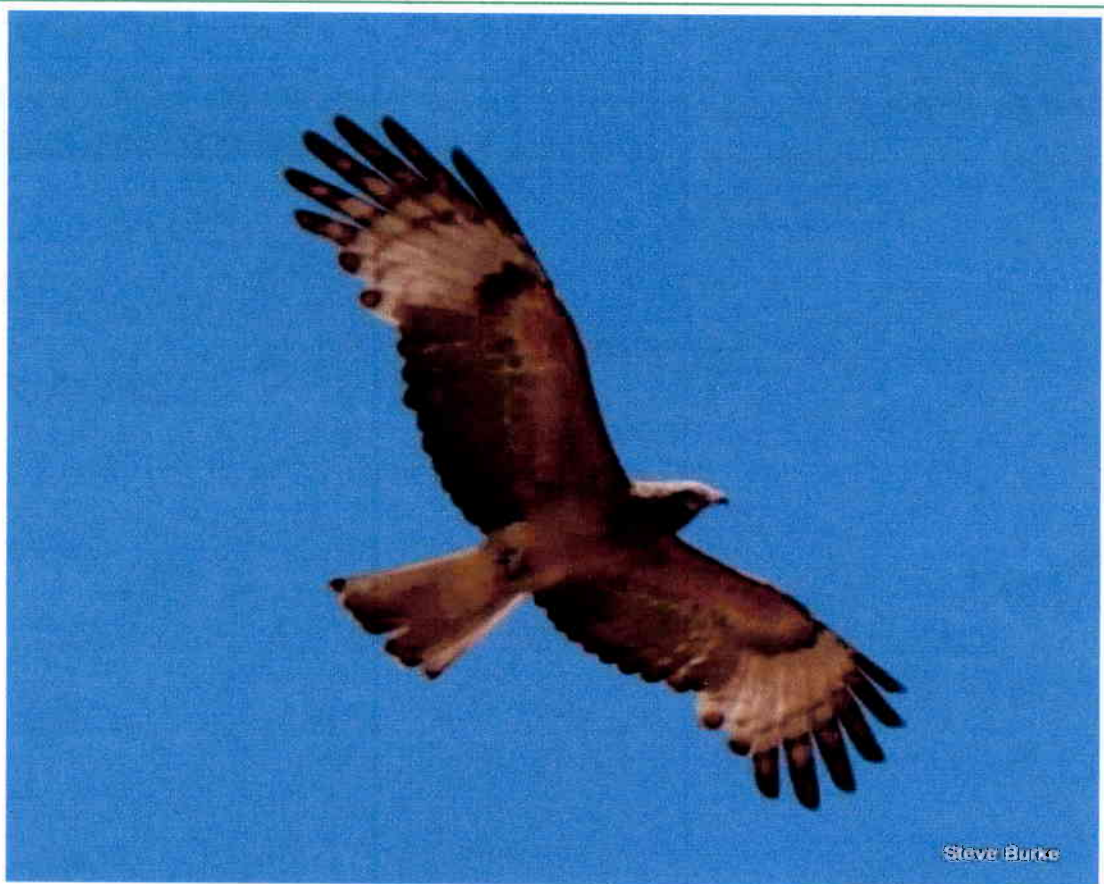
Square-tailed Kite photographed at Bollon.

For more details please contact Olive Booth on 4633 0553 or email Olive at o.booth@bigpond.com