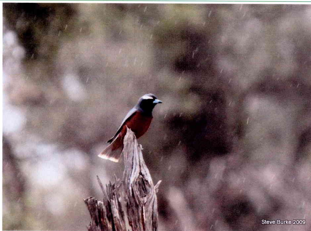
A White-browed Woodswallow in the rain.