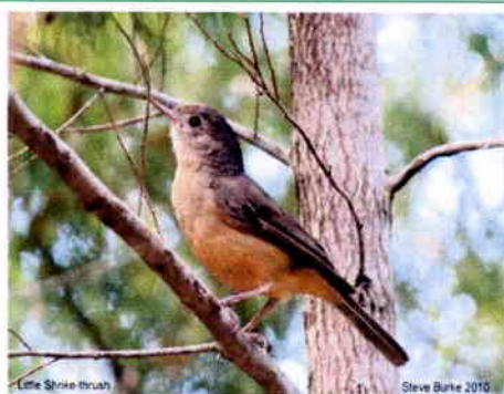
Little Shrike-thrush at Inskip Point.