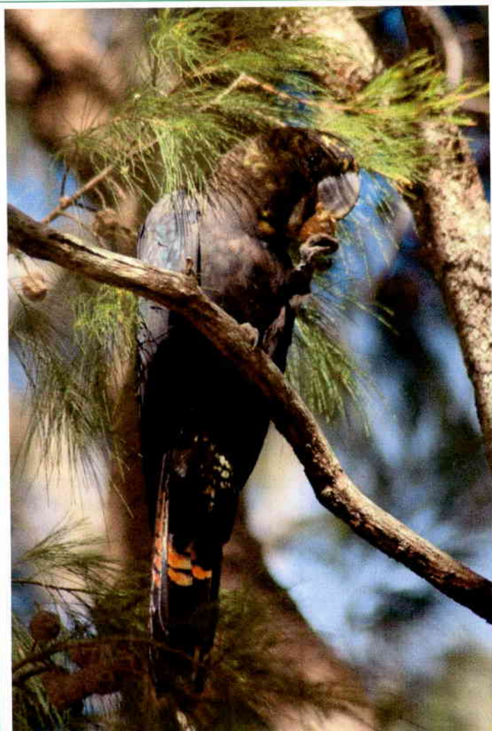
Glossy Black-Cockatoo.

With the birds still enjoying the cones and dropping many to the ground, our dog "Mate" by now had taken a fixed interest in them. The birds were moving about, still feeding and calling quietly.