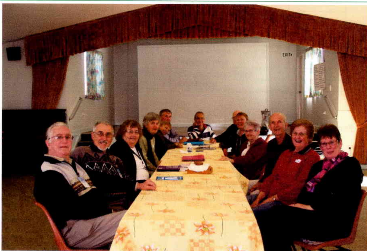
Some of the attendees at the luncheon.

Many thanks to all who attended .The success of this function means, we will schedule more in the future.