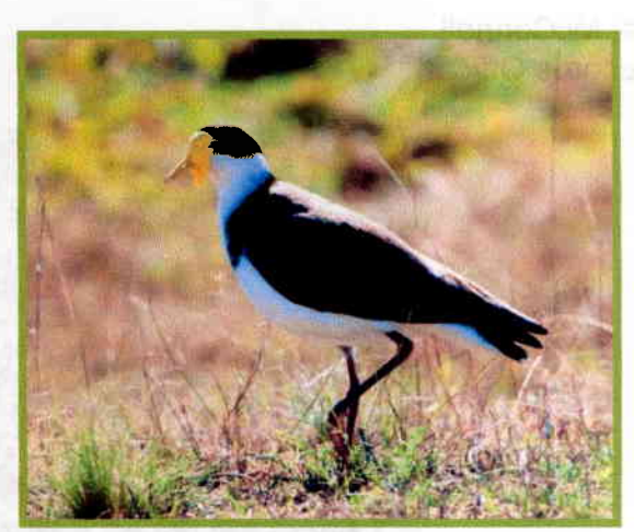
Masked Lapwing