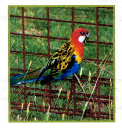
Eastern Rosella

For all bird photographers... amateur, professional and anywhere in between, please send your favourite photos in to be published in our monthly newsletter.