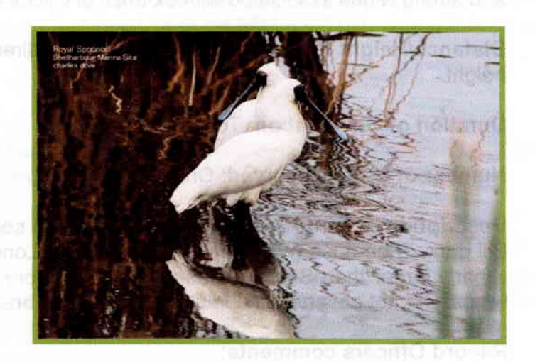
Royal Spoonbill