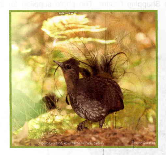
Superb Lyrebird